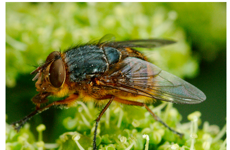
Rango taumaro (Brown blowfly)