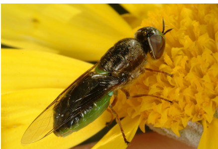
Green soldier fly