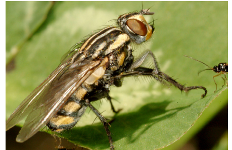
Striped dung fly