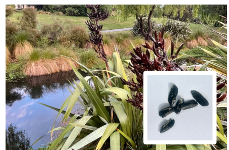
Harakeke / NZ flax