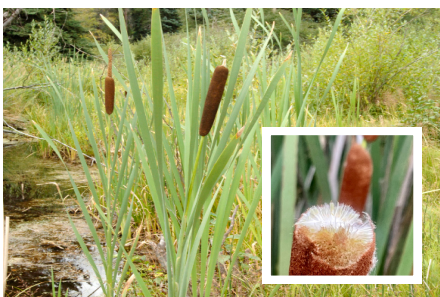
Raupō / Bulrush