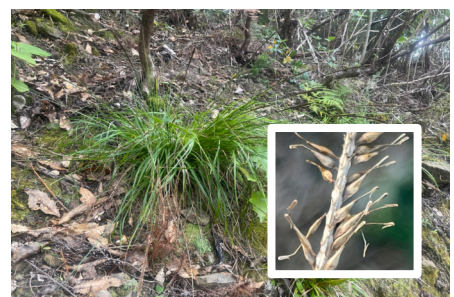
Kamu / hook grass