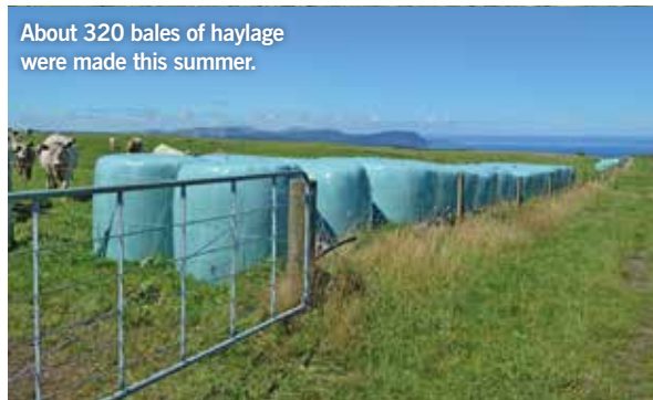
About 320 bales of haylage were made this summer.