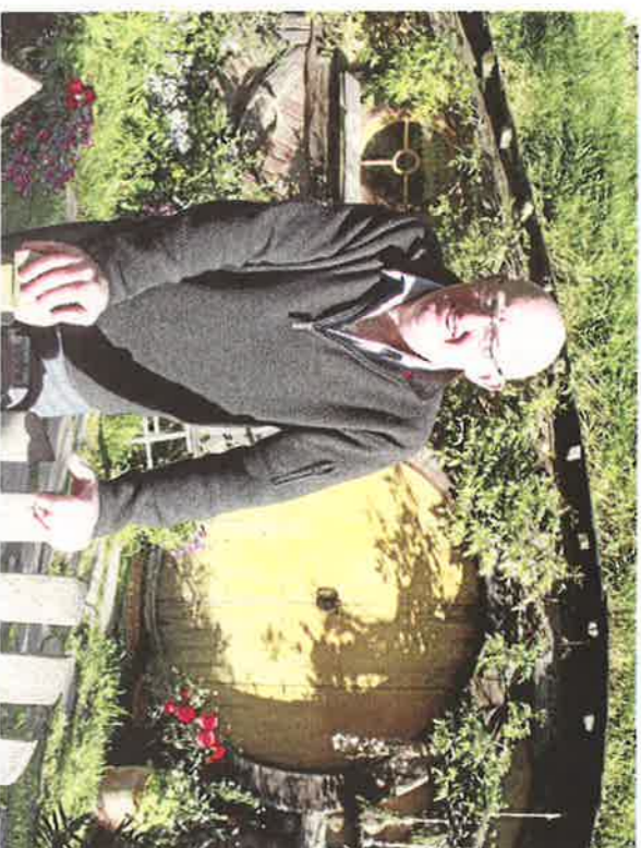
Is it the Shire or the Alexanders' farm? The view from Bilbo Baggins' house.

"We have taken the avenue of trying to develop and diversify as a family to give us the strength to go down whatever channel we want. It's up to us how far it can go."